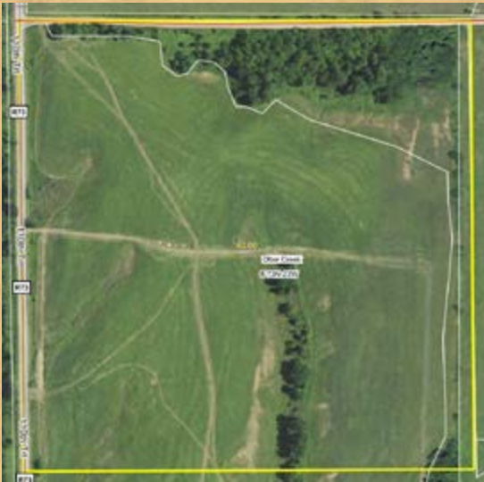
Tract 1 Aerial Photo