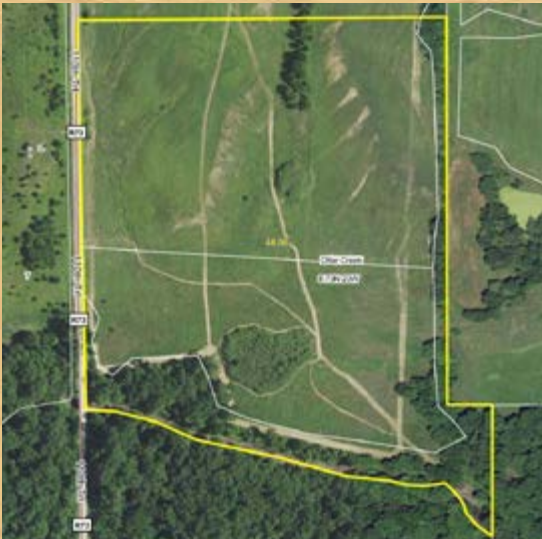
Tract 2 Aerial Photo