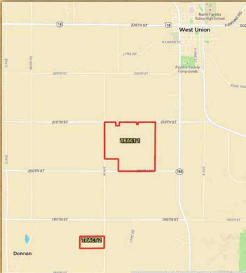
Property Location Map