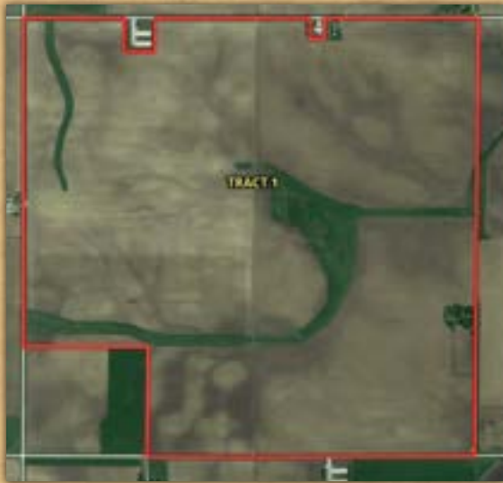
Tract 1 Aerial Photo