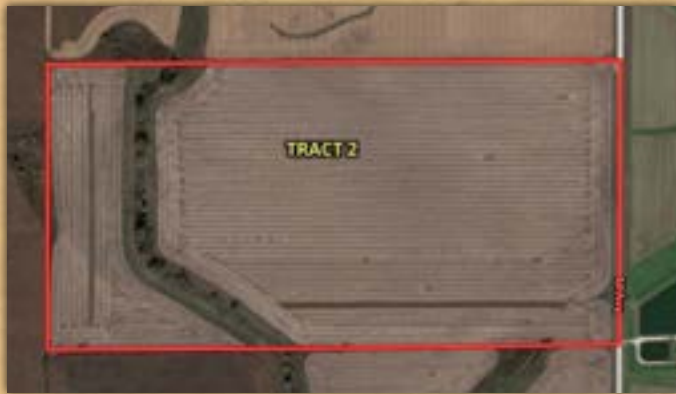
Tract 2 Aerial Photo