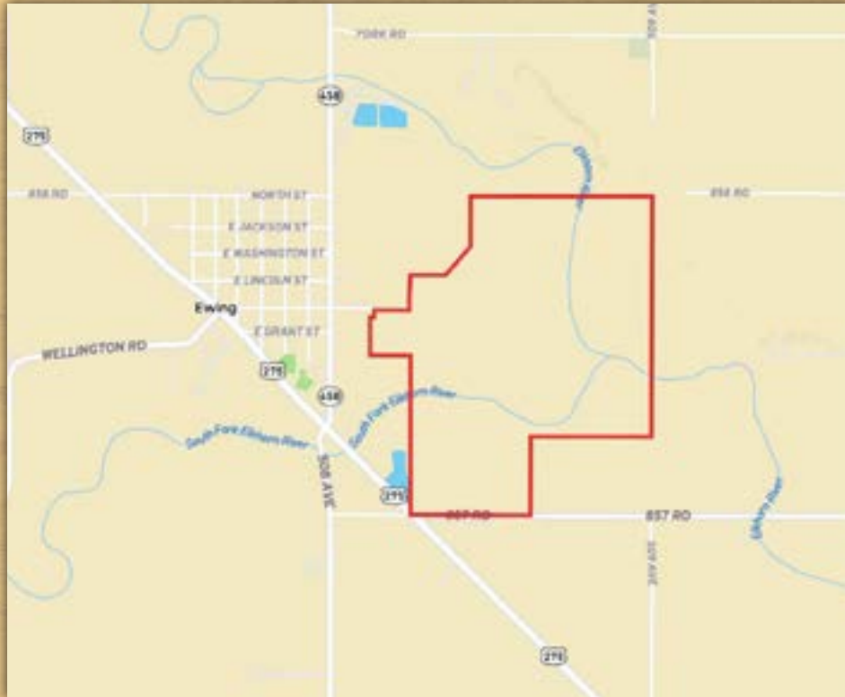
Property Location Map