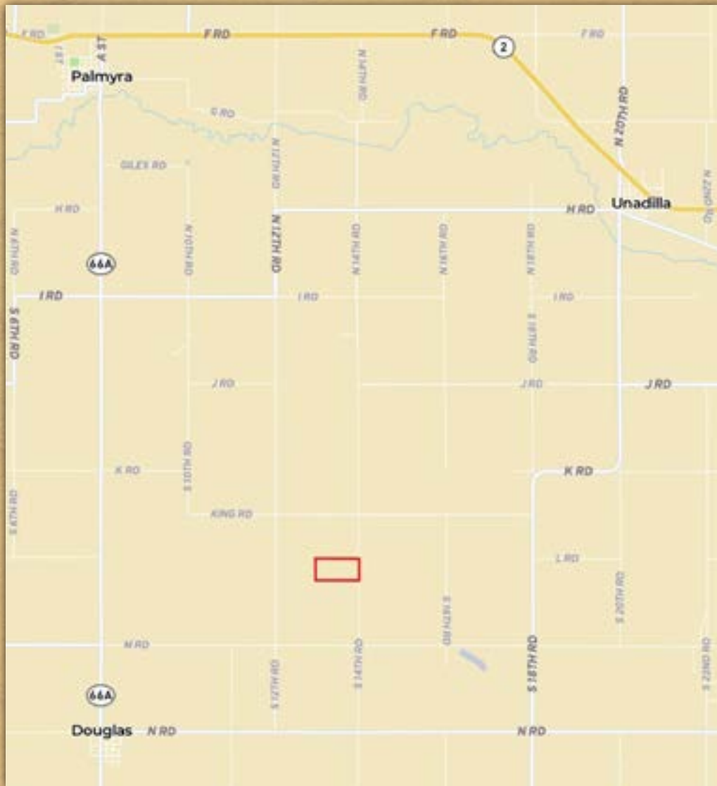
Property Location Map