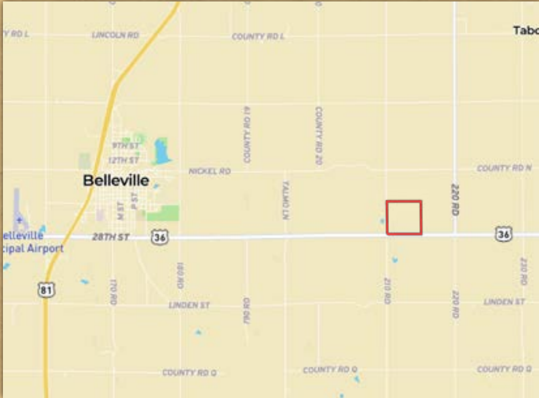
Property Location Map

156.8+/- Acres • Republic County, Kansas