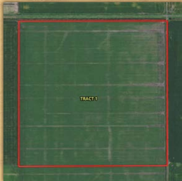
Tract 1 Aerial Photo