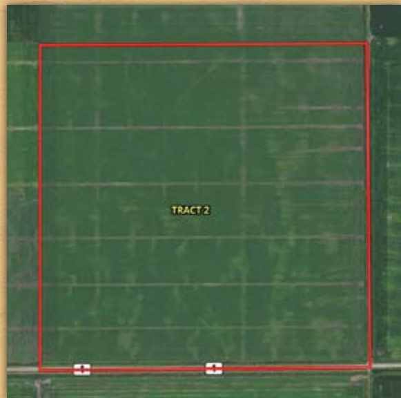
Tract 2 Aerial Photo