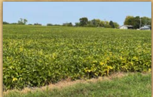
Property adjacent to current residential