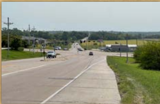
Intersection of 36th Street and Cornhusker Road