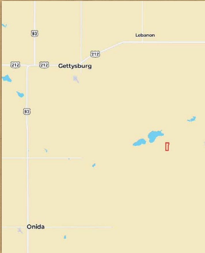
Property Location Map

215+/- Acres • Sully County, South Dakota