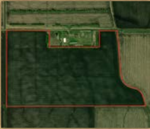
Tract 1 Aerial