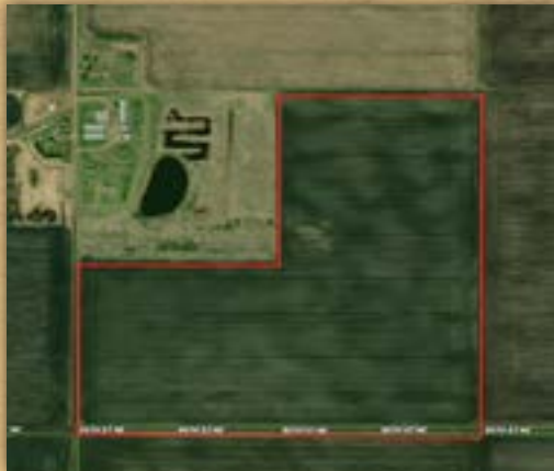
Tract 2 Aerial