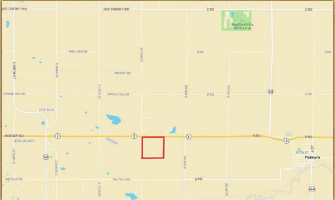
Property Location Map