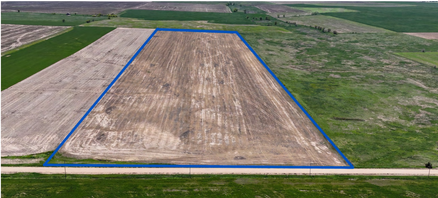
Tract 2 Aerial Map