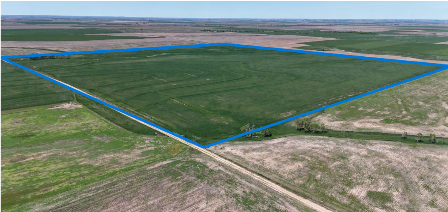
Tract 1 Aerial Map