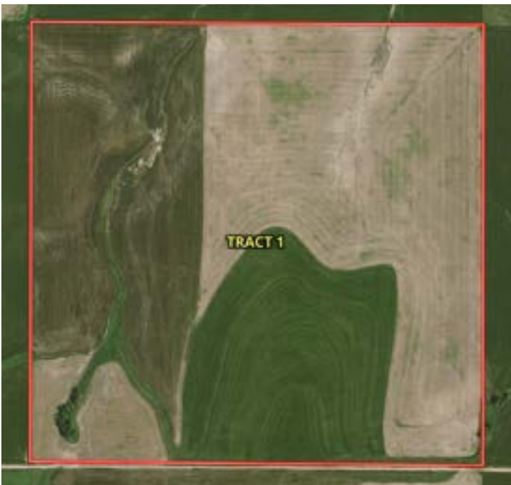
Tract 1 Aerial Map