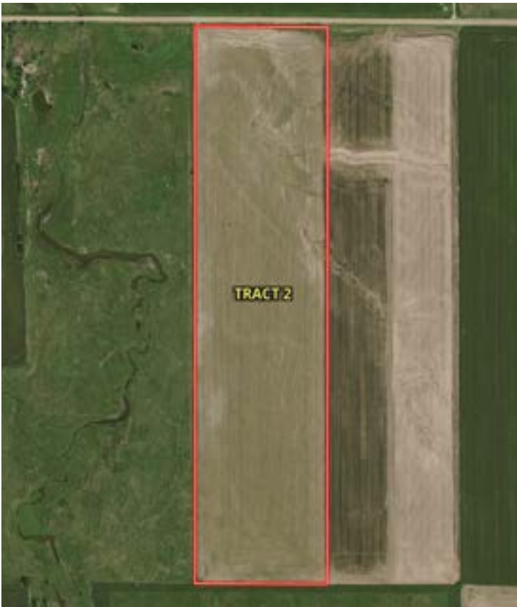
Tract 2 Aerial Map