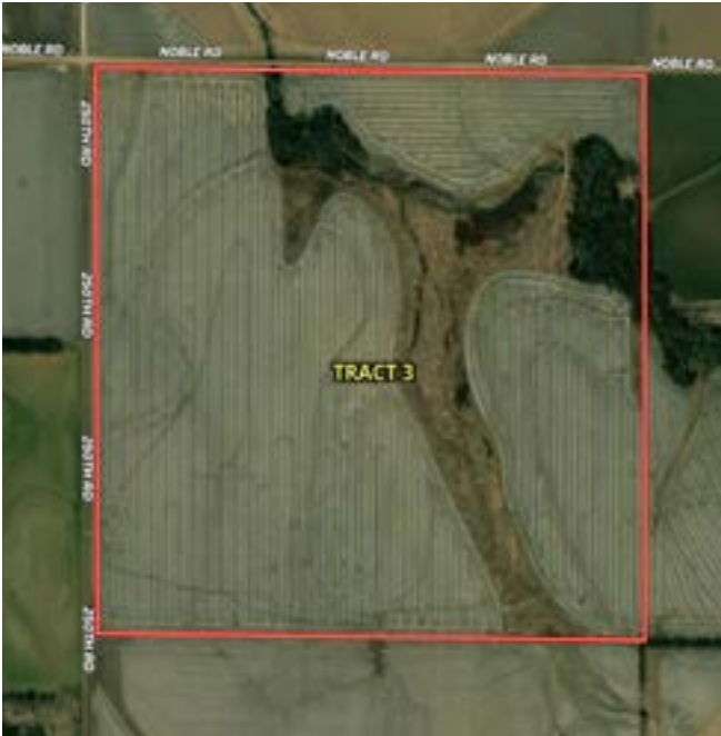
Tract 3 Aerial Map