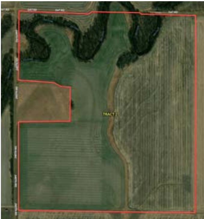
Tract 2 Aerial Map