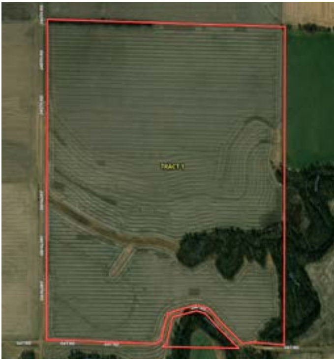
Tract 1 Aerial Map