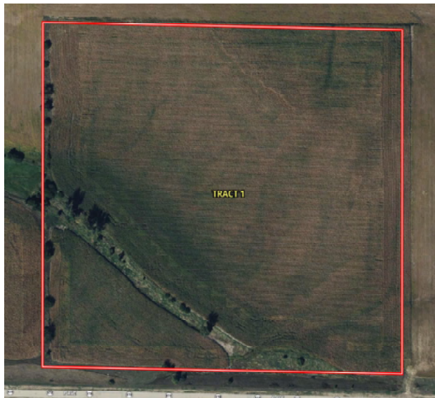
Tract 1 Aerial Map