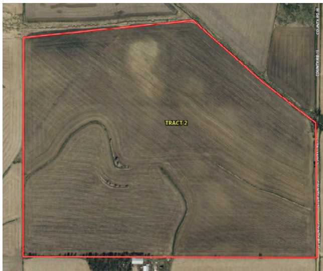
Tract 2 Aerial Map