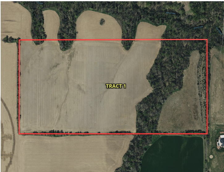
Tract 1 Aerial Map