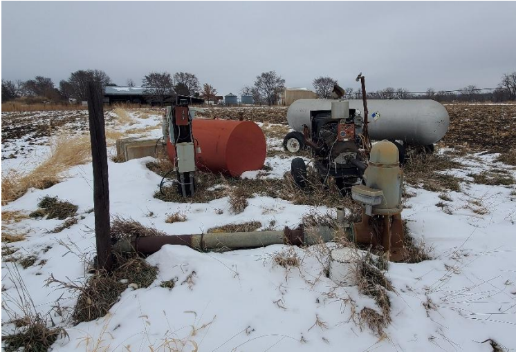
Well # G-064243