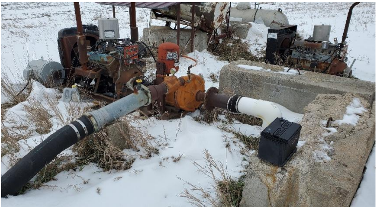
Well # G- 168513