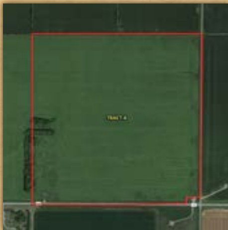
Tract 4 Aerial Photo