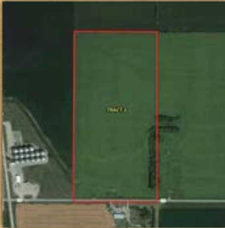
Tract 3 Aerial Photo