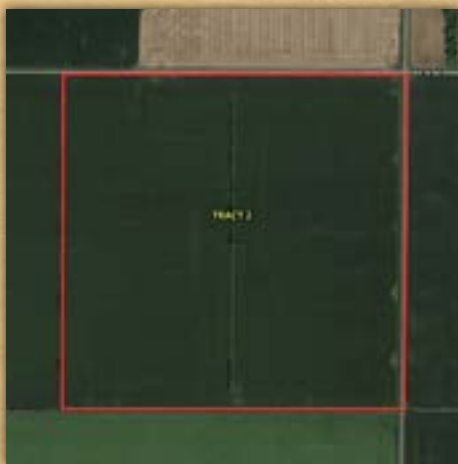
Tract 2 Aerial Photo