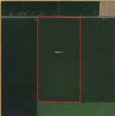
Tract 1 Aerial Photo